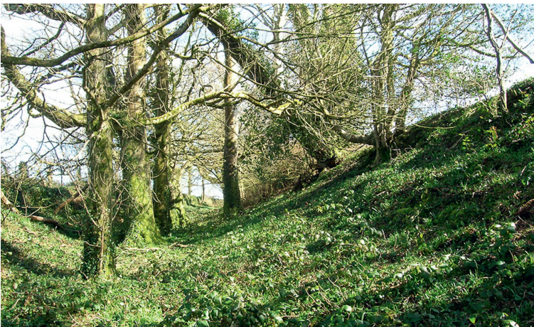
Fig 6 The well-preserved northern bank and ditch at Carvossa.

These geophysical surveys have demonstrated that the enclosure at Carvossa was defined by a single rampart and ditch, and that access to the interior