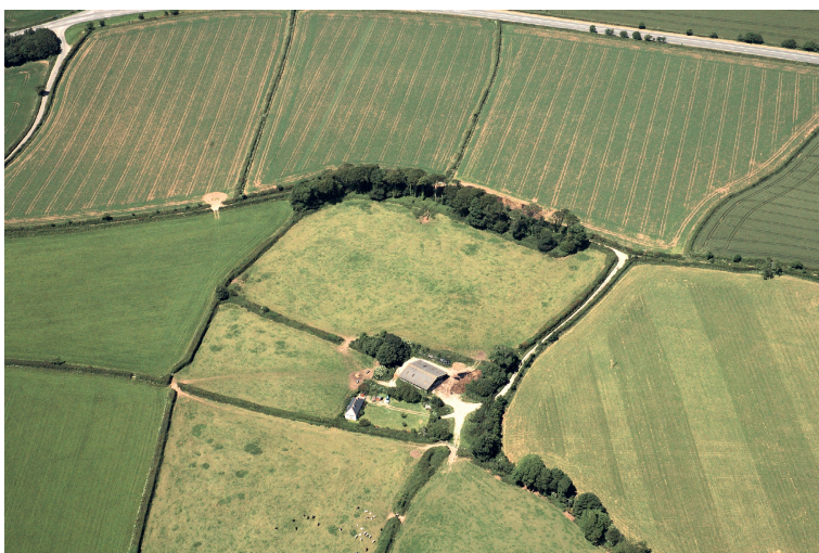
Fig 2 Aerial photograph of the enclosure at Carvossa. (HER AP F69/224 taken June 2005 by Steve Hartgroves. ©Cornwall Council.)

which would have been a more suitable location if proximity to the stream was the main determining factor (Fig 1).